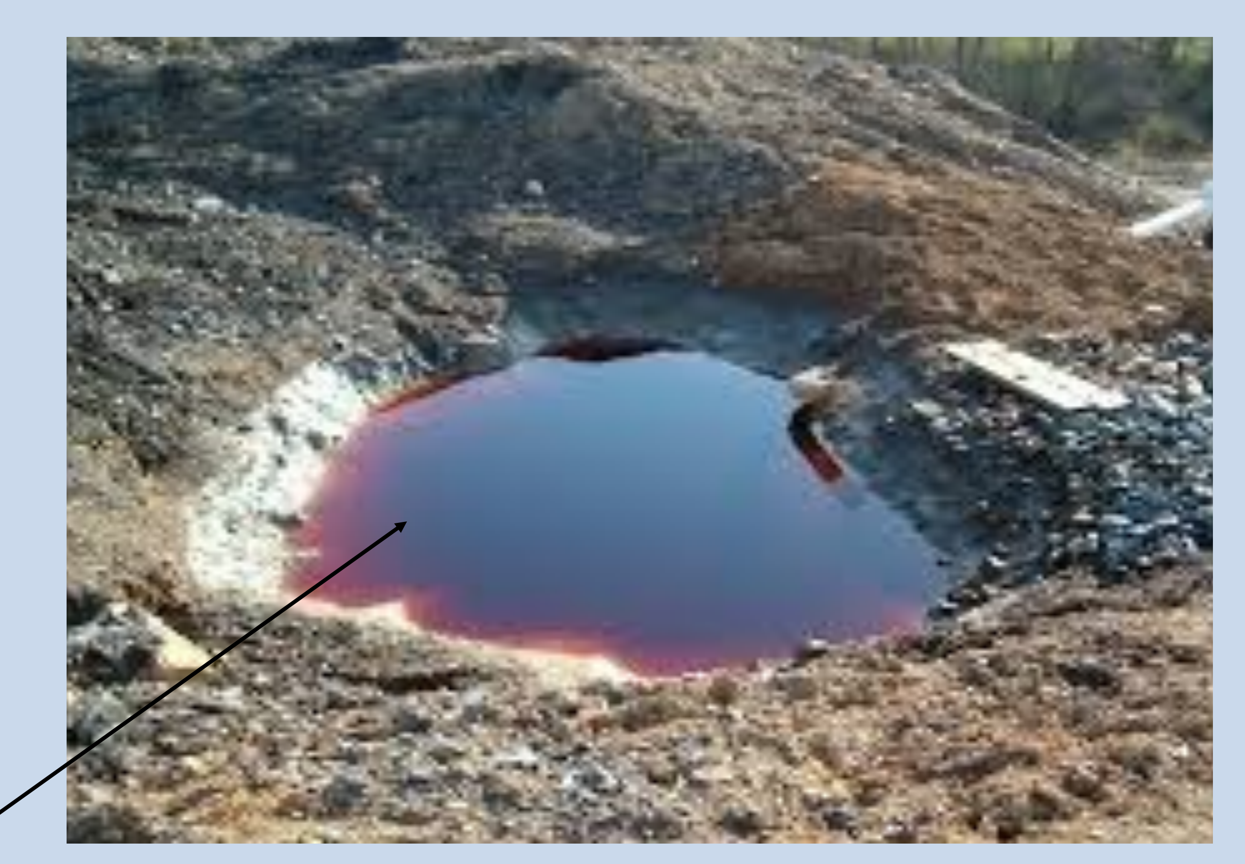
Acid Rock Runoff -

If left untreated, it <u>may</u> result in environmental issues, similar to acid mine drainage.